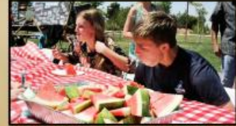
FREE WATERMELON: All day! Start time for Watermelon-Eating Contest is 1:50 p.m.