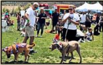
POPULAR PET SHOW: Starts at 12:20 p.m. Doggie costumes should also reflect an 1800s theme. Other categories are Best Trick, You Ain't Nothing but a Pound Dog' and Judges' Choice.