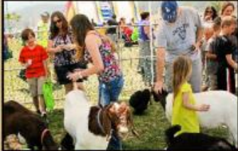
FREE PETTING ZOO: Plus Face-Painting, Train Rides, Games, Crafts, Cakewalks, Bouncers, Prizes, Live Entertainment. Tons of FREE Family Fun!