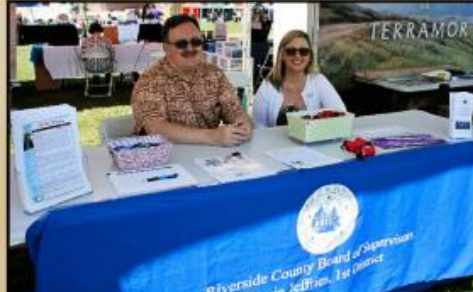
MEET AND GREET: Visit with your local businesses, elected officials and community service providers. Don't forget to vote for your favorite picture at the Photo Booth!