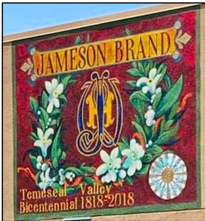
TODD ACADEMY: A citrus theme was chosen for the school located in Sycamore Creek.

Of all the Bicentennial activities this past year, perhaps the murals will stand as the most lasting remembrance of the community celebration for Temescal Valley's 200 th birthday .