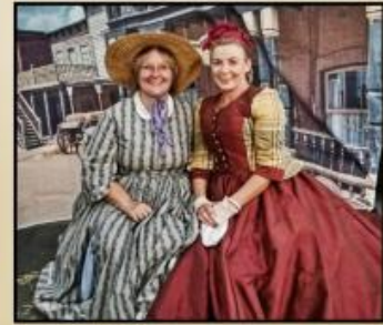
COSTUME CONTEST: At 1 p.m. Categories: Kids, Adults, Families. Don your best garb from the 1800s – whether Old West, Pioneer or Gold Rush Days!