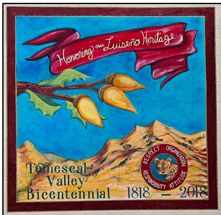
LUISENO SCHOOL: An acorn theme was chosen for the school located in Horsethief Canyon Ranch.