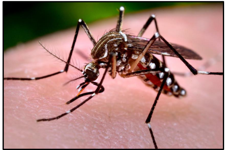
A DEADLY BLOODSUCKER: The Aedes mosquito feeds during daytime hours and can carry the deadly Zika virus.

WeAreTV.org/Bicentennial/ . Please join us at 9 a.m., Saturday, May 25 for our next Bicentennial Committee meeting in the Temescal Room at the Trilogy Lodge, 24503 Trilogy Parkway.