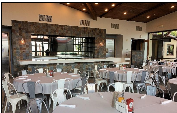
ABOVE: The Canyons Grille dining room.