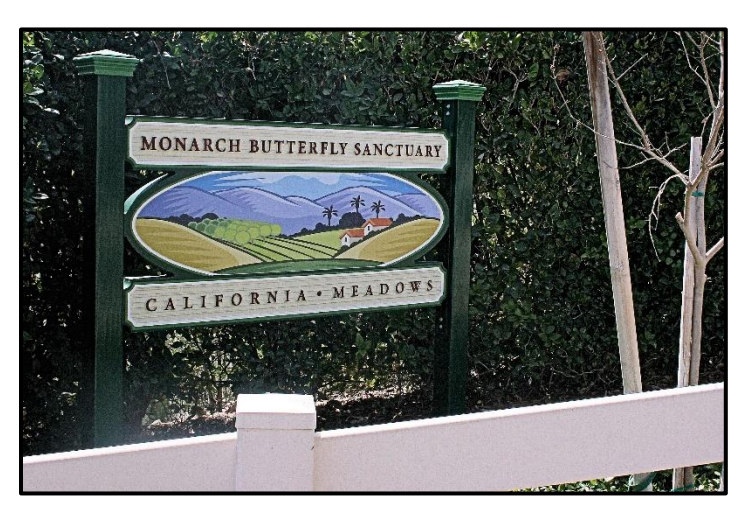
WELCOME MONARCHS: The California Meadows Homeowners' Association has remodeled a neighborhood park, turning it into a butterfly sanctuary for monarchs by planting native milkweed and nectar plants.

All conservation efforts made in the past two years for the Milkweed to Monarch project will be included in the questionnaire.