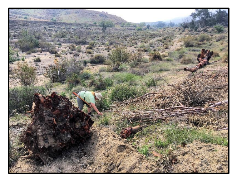
PLANT IT – THEY WILL COME: Tracy Davis spreads native milkweed seed in Temescal Valley wildland areas.