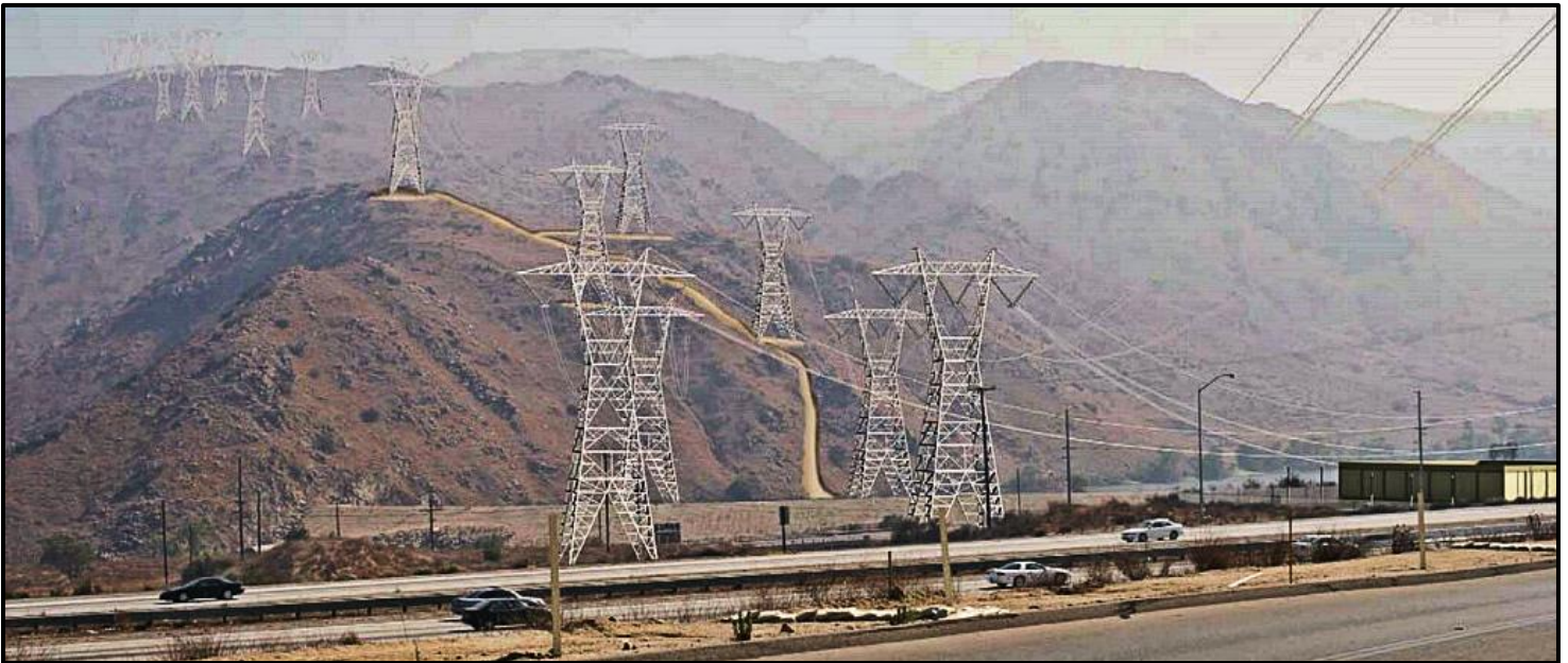
NEVADA HYDRO SIMULATION: Looking to the east from De Palma Road, south of the Shops at Sycamore Creek center and north of Glen Eden. Yellow building at right is the proposed lake switchyard. Lee Lake can be viewed behind the switchyard.