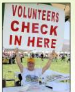
Volunteers Always Needed