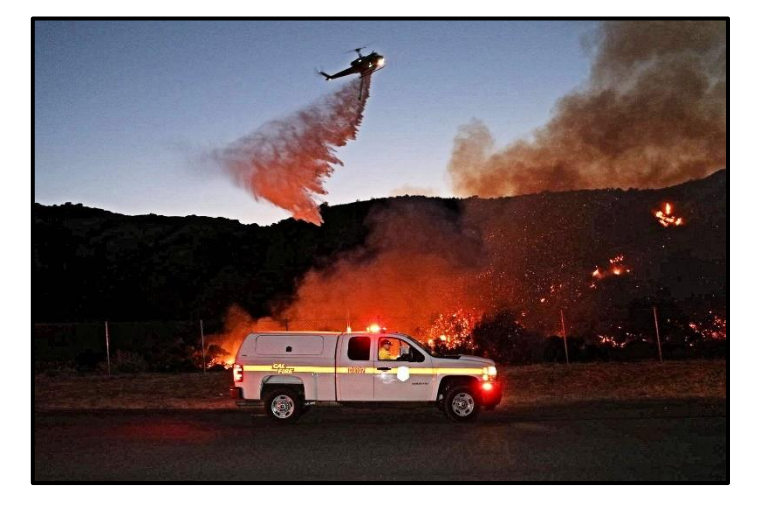
AIR SUPPORT: A helicopter dumps a load of fire retardant to deter the spread of the Jameson blaze. Other helicopters used water from The Retreat Golf Club pond to extinguish the flames.