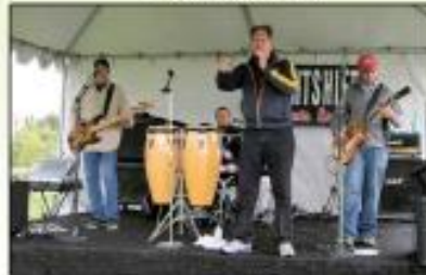
Nightshift performs Classic Rock