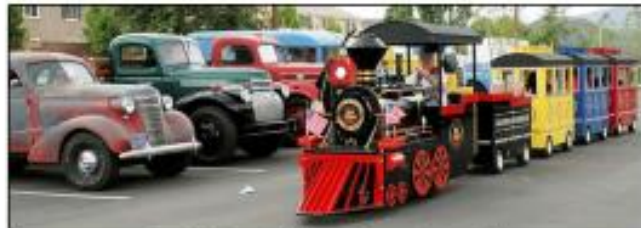
The Car Show and Miniature Train are always a hit!