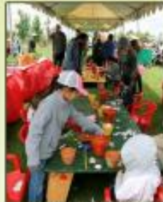
Free Crafts for the kids