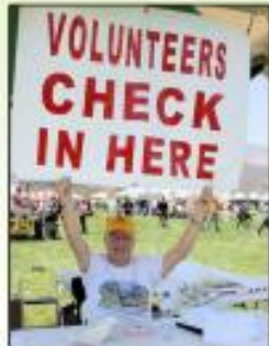
Volunteers Always Needed