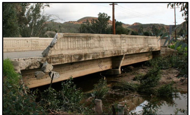
ROAD CLOSURE: Recent rains damaged the Temescal Canyon Road bridge north of Lake Street. The road is closed until repairs can be made.

While the land-use changes were approved, the development plans must still be reviewed by the county Planning Commission and then approved by the Board of Supervisors at a date yet-to-be determined. Both meetings would involve public hearings, giving people the opportunity to comment either for or against the project.