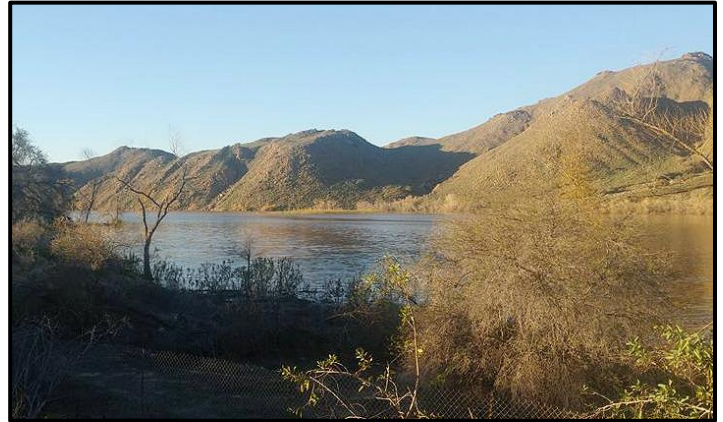
SITE OF FUTURE DEVELOPMENT: Lakeside Temescal Valley, if approved, would be a 370-home housing development built on 67 acres between Lee Lake and Temescal Canyon Road.

The need to repair or replace the bridge has been an ongoing topic at City Council meetings for many years. The bridge has a rating of 68.5 on the Federal Highway Administration's Highway