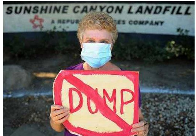
RESIDENTS PROTEST ODORS: Granada Hills residents last year staged a protest at the Sunshine Canyon Landfill in Sylmar.